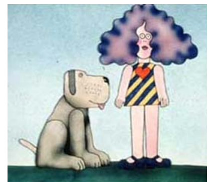
Crystal Tipps (& Alastair)?