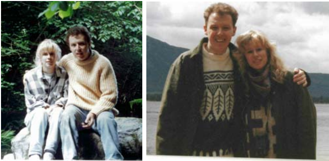
From our 'The Good Life' phase, when hair was BIG and jumpers were cosy