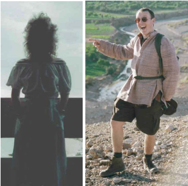
From my Romany phase. Poor quality photo, but I think the outline is humiliating enough, don't you? Weren't perms wonderful?