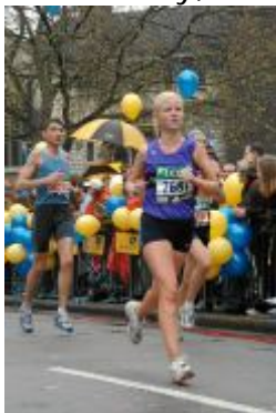
The real Claire in action at London

Just briefly, marathon day couldn't have